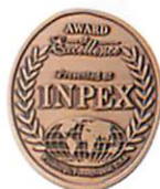
United States of America